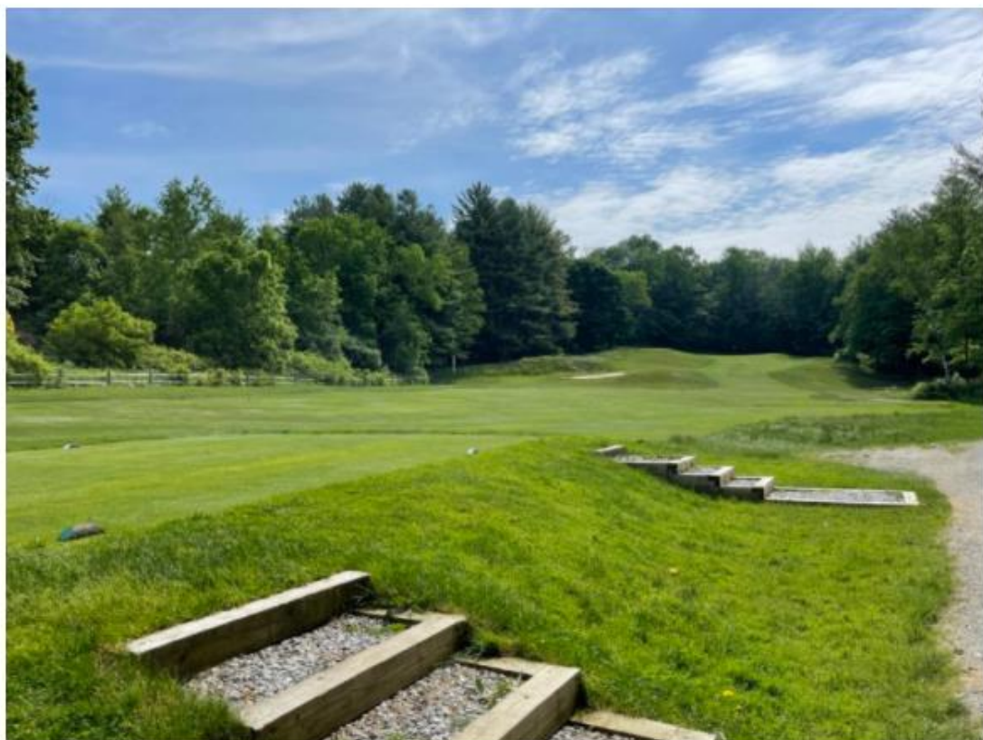
New forward tees have been added to many of the holes at Wyndhurst.

One person plays golf, the other enjoys a spa day or another activity. Both come away happy. Win-Win.